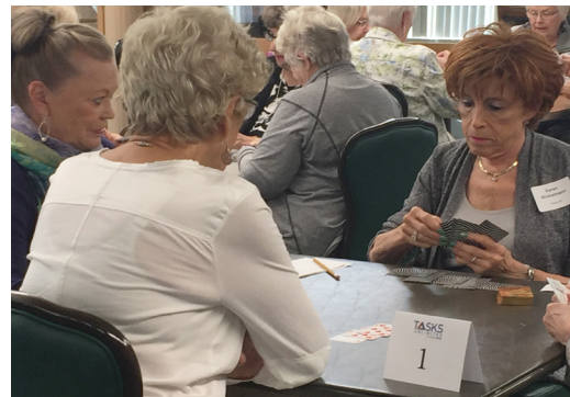
Above: Players concentrating on Bridge game.

Bridge for Tasks was held Sept. 24, 2018 at Church of St. Patrick-Edina. Attendees chose to play Bridge or Five Hundred at $45 per person, which included games, snacks, and a delicious hot dish luncheon. The tournament style play was competitive with Bridge participants eagerly awaiting the scores at the end of the day.