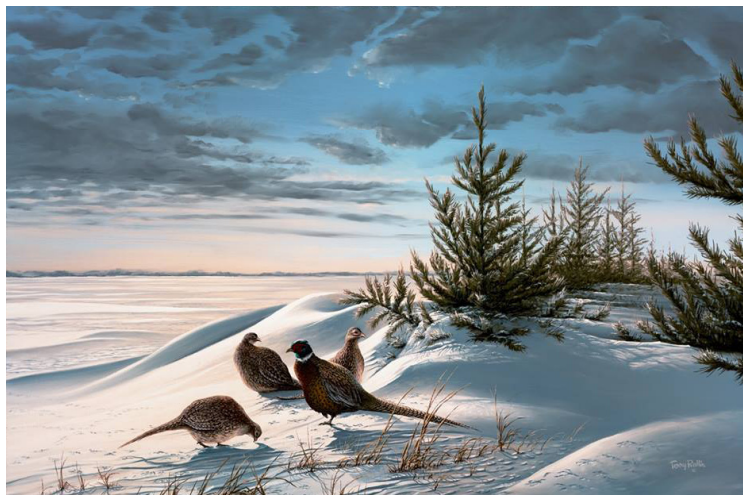
Quiet Afternoon, Terry Redlin, 1978, Print #25