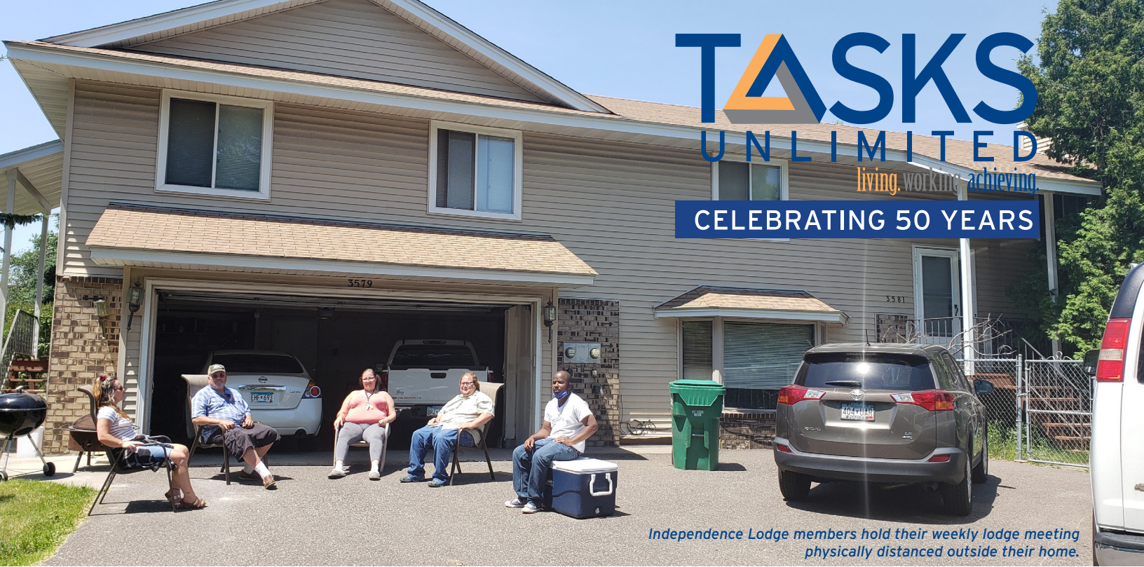
Independence Lodge members hold their weekly lodge meeting physically distanced outside their home.